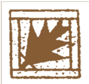
November Block of the Month