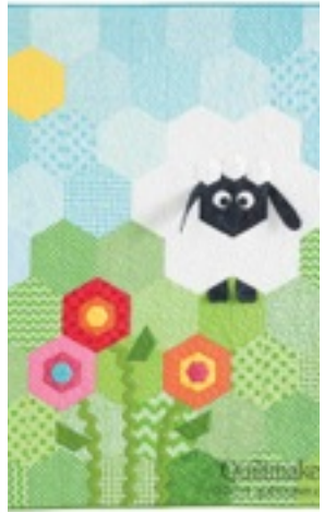
Sheep Shape Quilt