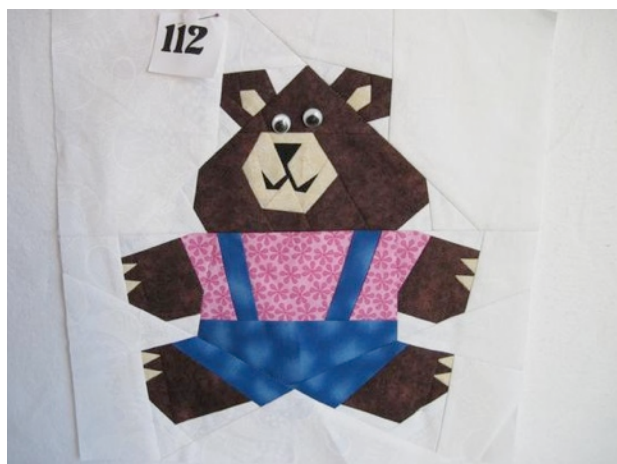
Challenge Winner 2nd Place

Just for your information, Quilt Fest in 2013 will be held at the Zermatt October 9-12. If you plan way ahead, you can mark your calendars now.