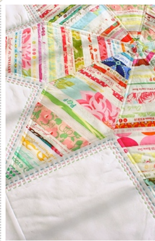
Salvage Edge Quilt