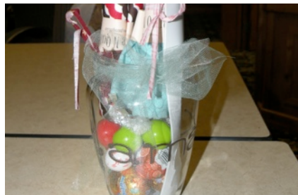
Contact Tamara to donate items for the retreat.