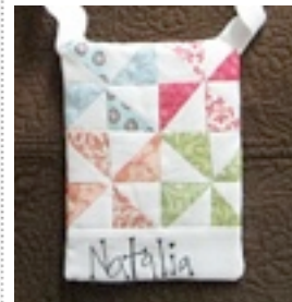
Don't forget your nametag!

Join us for our monthly guild meetings, 7:00 p.m. on the FIRST THURSDAY of each month.