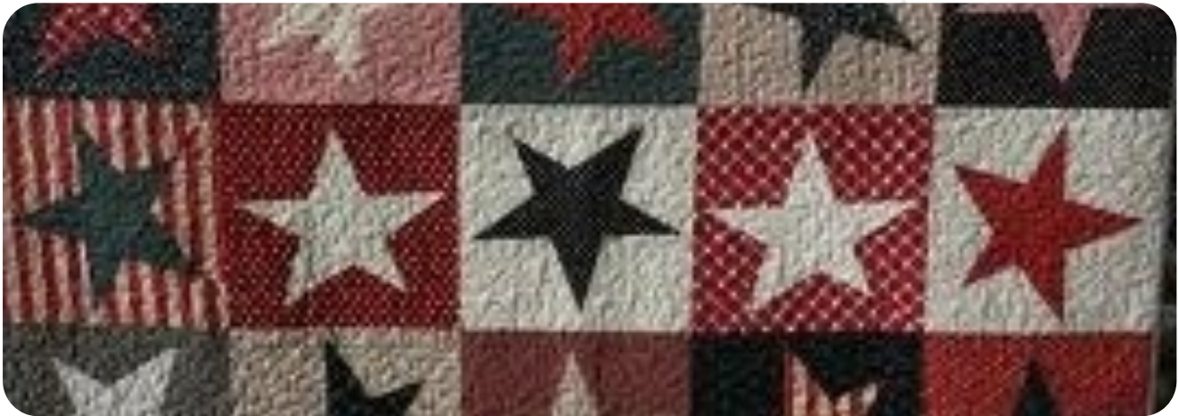
4th of July Quilt