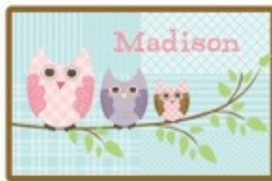
Don't Forget your Name tag!

Join us for our monthly guild meeting, Thursday, July 11 7:00 p.m. @ The AM Bank Building