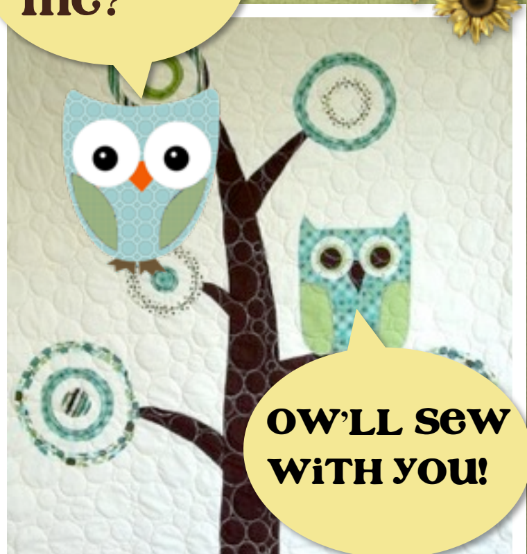
Owl Baby Quilt