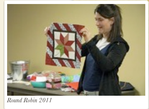
Round Robin 2011

Quilters of every skill level make up our membership. Don't be afraid to ask questions. We are all here to learn together, and you will find that quilters are the nicest people and are more than willing to share their ideas and expertise. Guild is a wonderful place to learn new skills, share ideas, and make new friends. And be sure to check out our guild blog: hebervalleyquilters.blogspot.com to meet some of the fun, creative ladies in our guild!