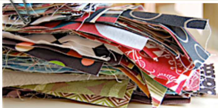
What to do with these scraps?