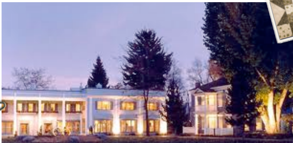
The Homestead Resort, Midway, UT