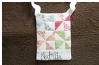
Don't forget your nametag!