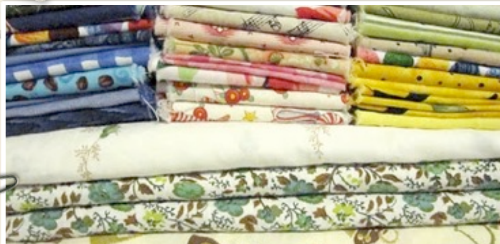
What to do with all those scraps?