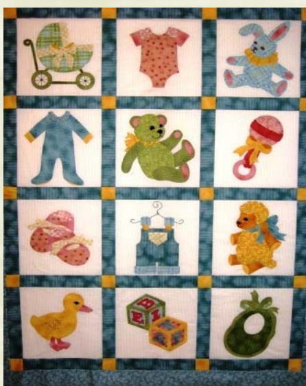
LULLABY - 2008 GUILD QUILT PROJECT

grand prize—a gift certificate to SEASONS OF HOME —to be drawn at our Christmas Social in December.