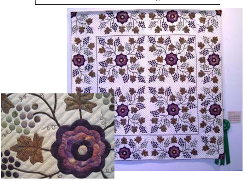
Marilyn Toone's stunning quilt with 1600 appliquéd grapes—Springville Art Center Quilt Show (HVQ Guest Instructor—March 2008)

September 23--27 Utah Quilt Guild ~ Quilt Festival Eccles Conference Center—Ogden, UT