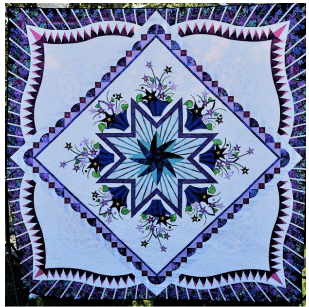
Quilt Fest Opportunity Quilt

The state guild is also going to start a new UFO challenge for 2023. The information will be in the February Beeline. Prizes will be awarded each month.