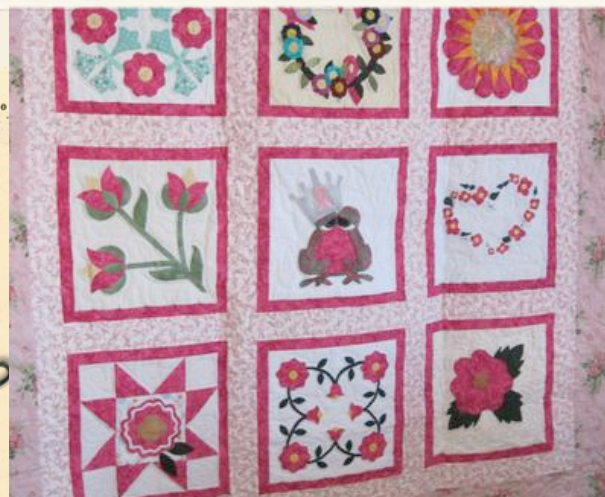
One of the assembled quilt tops for Quilt for the cure

So much more information in the Beeline Newsletter. Become a member for only $20 a year.