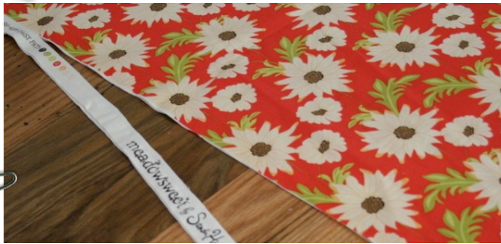
An Example of a 2 Block Quilt