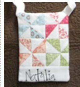
Don't forget your Nametag!

Join us for our monthly guild meetings, 7:00 p.m. on the FIRST THURSDAY of each month.