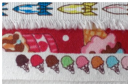
More Salvage Edges