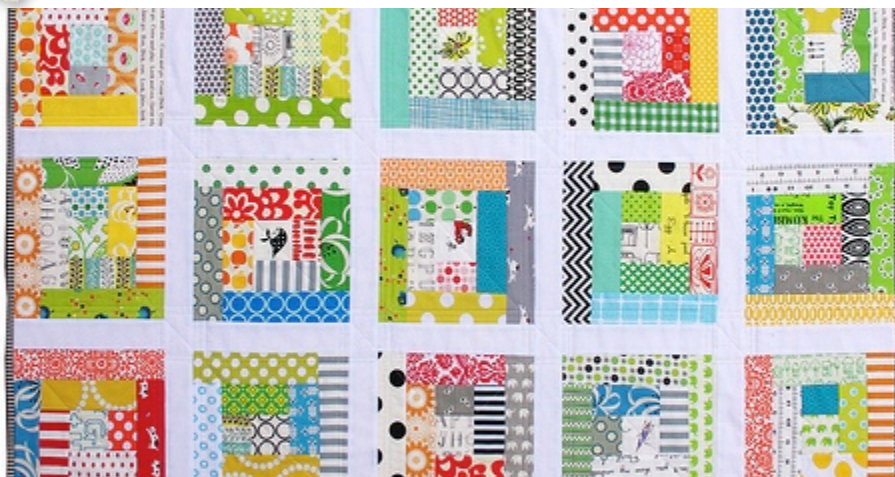
A Scrappy Log Cabin Quilt