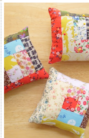
Log Cabin Quilt Pillows