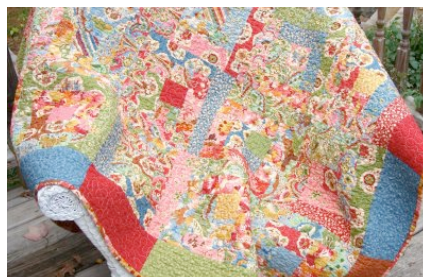
Scrappy Log Cabin Quilt