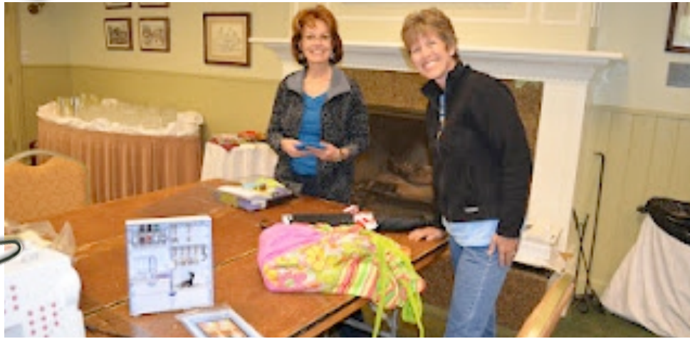
Chatting at the Retreat