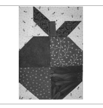
September Block of the Month