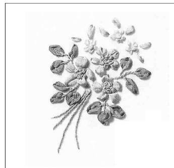
May's Block of the Month Options