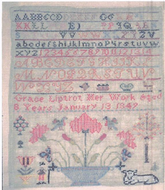
"Daughter's Sampler," by Grace Liprot, 8, created in 1849

"With Every Stitch" celebrates the artistry of historic and modern samplers at the Museum of Church History and Art, 45 N. West Temple, Salt Lake City, through Oct. 19, 2003