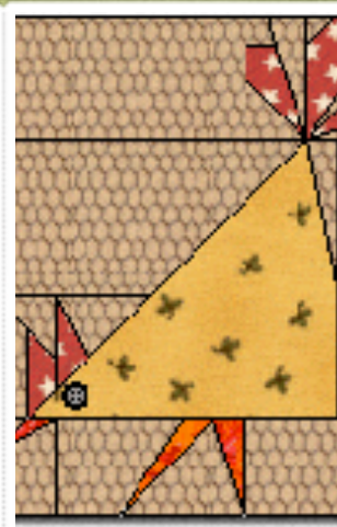
Silly Chicken Block