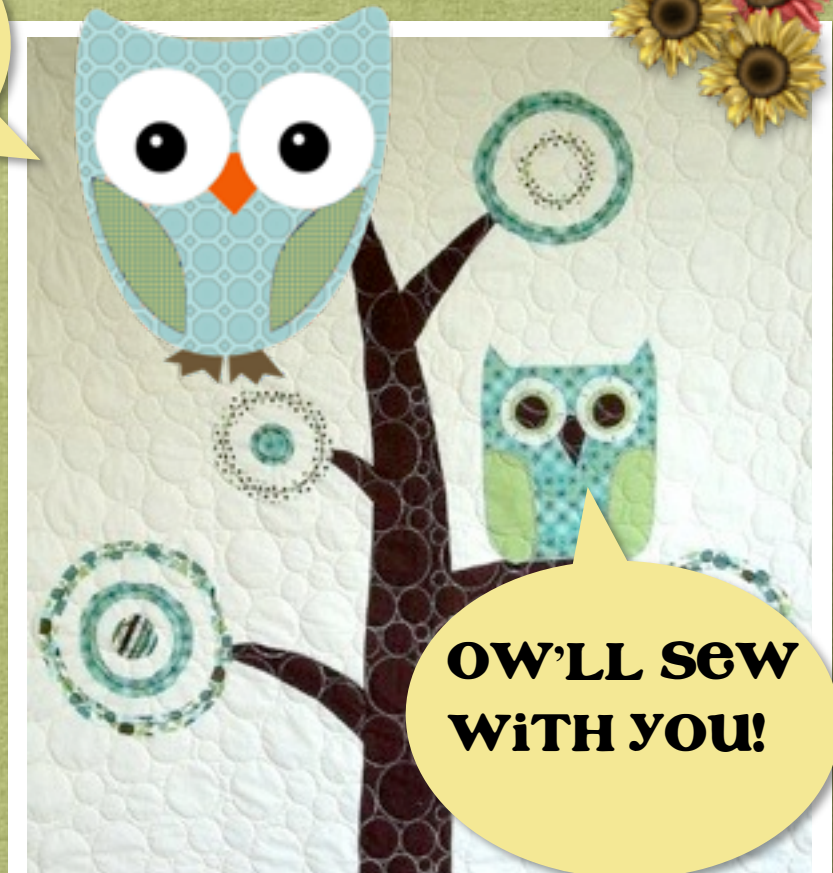
Owl Baby Quilt