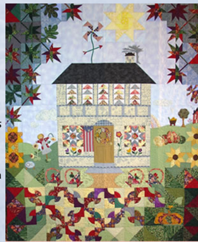
Villa Provence - 60" x 72"