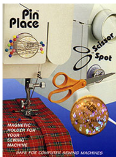
Pin Place/Scissor Spot:

Here are a few fun, inexpensive, cool tools to put on your Christmas list for under $5