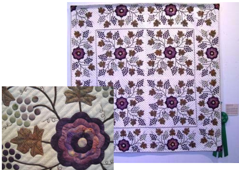
Marilyn Toone's stunning quilt with 1600 appliquéd grapes—Springville Art Center Quilt Show (HVQ Guest Instructor—March 2008)

July 15—September 4 Springville Museum of Art Quilt Show—Springville, UT (there is still time!) September 4—14 Utah State Fair ~ Salt Lake City, UT September 23--27 Utah Quilt Guild ~ Quilt Festival Eccles Conference Center—Ogden, UT