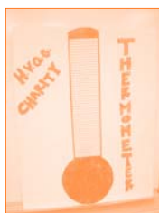
Crusan and Wendy

Pieced or not, quilted or tied, bring in your quilts crib size or larger, and add your name to the chart. Let's see if we can bring it to the boiling point!