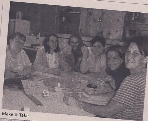
Make & Take